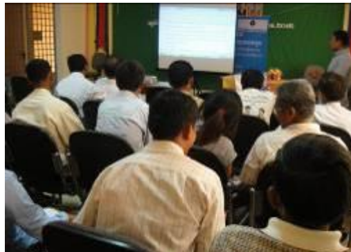
RCEDO staff is presenting the result of end project review to all participants at 27 March 2012.