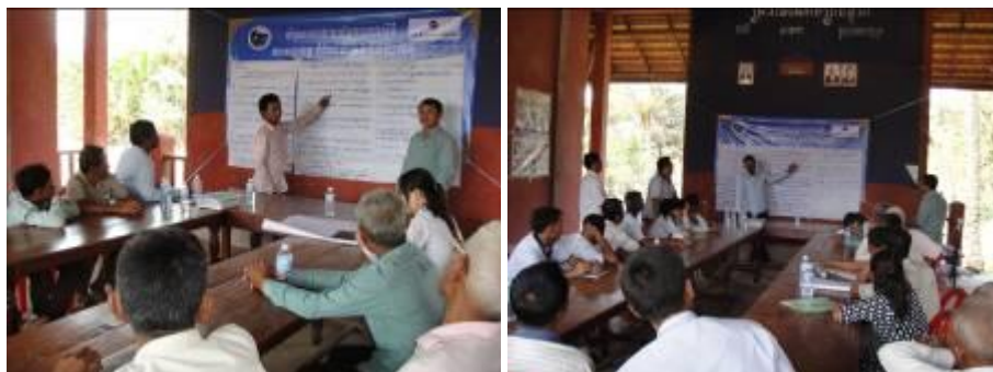
The Group Representative is presenting and sharing knowledge on good governance/ SA practices to the participants at Treas targeting commune of Svay Check district on 12 March.

The workshop review showed that key people, CRTs, CC and CBO members gained awareness and knowledge about their roles in participation in commune planning and decision-making processes and they have the right to demand commune councils and other public service providers to accountable for their actions and decision.