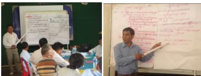
The representative of Chief of Operational District Hospital and Chief of District Education Office at Svay Check district presented their service improvement action Plan.