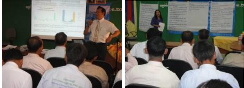
The free-land consultant for Pre and Post survey assessment is presenting all involvement stakeholders for feedback and comments on 27 Ma 2012.

knowledge about their roles in participation in commune planning and decision-making processes and they have the right to demand the government actors and other public service providers to accountable for their actions and decision. At the workshop, all the participants have made a comment and suggestion to RCEDO project on Civic Engagement for good governance should be longer than this year and spreading to more communes in the province.