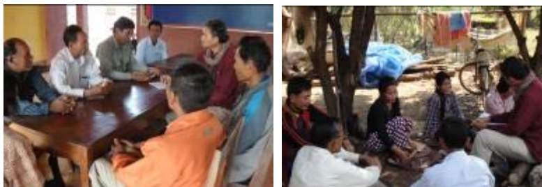
Post survey interviewed with the representative of CCs, CBOs, CRTs and local people at 6 target communes and two control communes on good governance/ SA practices within the