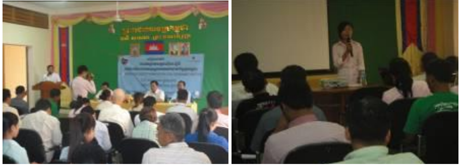
The representative of CBOs at O'Ampil, Krong Serei Sophorn was shared and presented the good local governance and SA practiced of CC within her target commune.

difference districts across the province had presented their experiences and other issues related to local governance practiced in their target areas. Finally, in order to respond what CBOs or CSOs had presented, the representative of CCs, DCs, and Department of Woman Affair Officer had shared and dialogue for a better information delivery to target group of the NGOs working area by engage them to participate in Commune Investment Plan (CIP) ( See Assessment Note #22 for details).