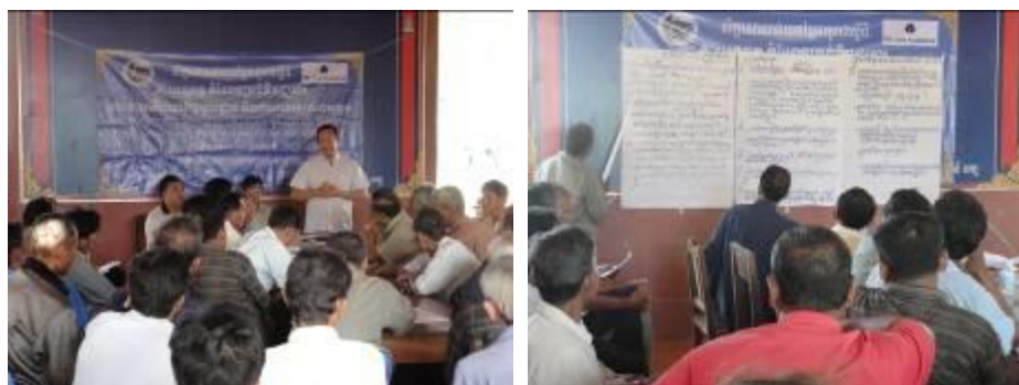
Group Representative is presenting and sharing knowledge on good governance/ SA practices to the participants at controlling commune (Slar Kram) of Svay Check on 13 March 2012.